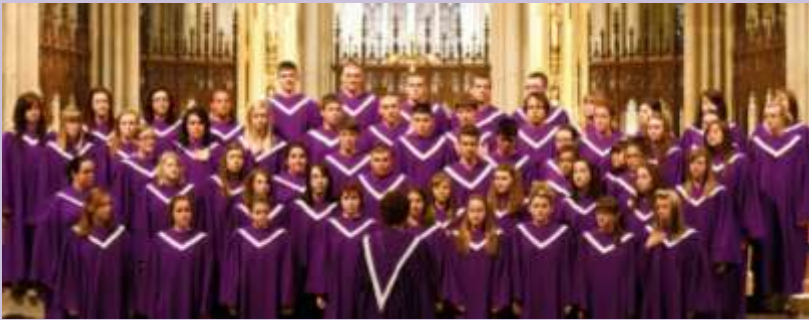
Students perform at St. Patrick's Cathedral